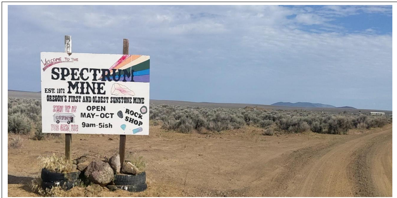
Entrance to the Spectrum Mine.