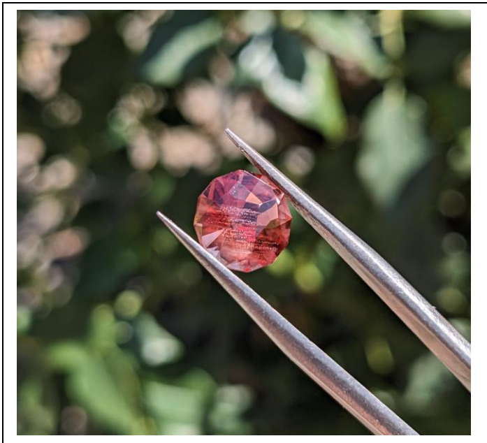
One of the Oregon sunstones stones Patrick faceted.