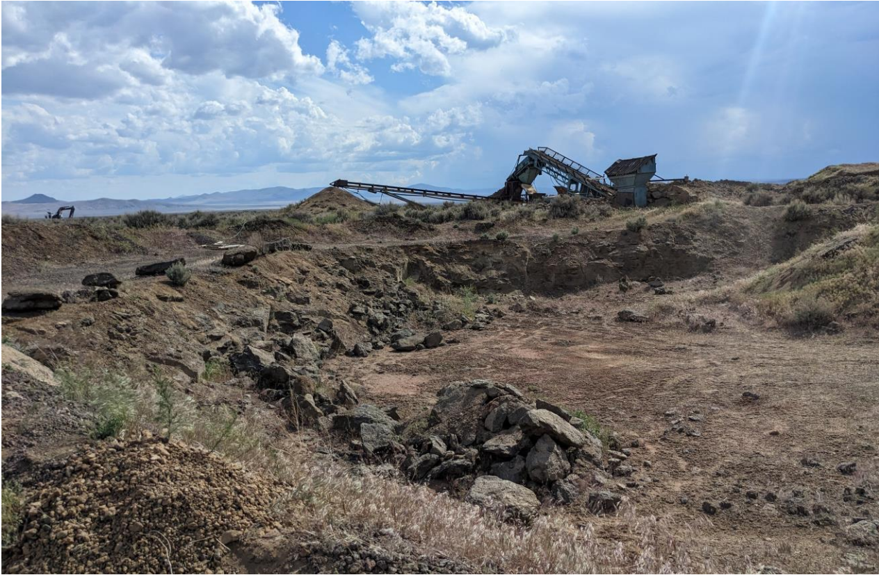
The Spectrum Mine.