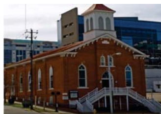
Dexter Avenue Baptist Church & Museum