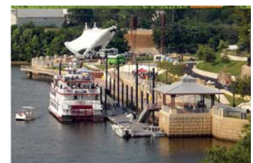
Harriott II Steamboat and Riverfront Park

Montgomery is the capitol of Alabama and the county seat of Montgomery county. It is named for Richard Montgomery, located on the Alabama River in the Gulf Coastal Plain. As of the 2013 Census Montgomery was the 2nd largest city in Alabama and the 115th largest in the United States. In 1861 Montgomery was selected as the first capital of the Confederate States of America. In the mid-20th century, Montgomery was a major center of events and protests of the Civil Rights Movement, including the Montgomery Bus Boycott and the Selma to Montgomery Marches. Montgomery has also been recognized nationally for its downtown revitalization and new urbanism projects.