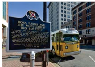
Rosa Parks Museum and Civil Rights Museum