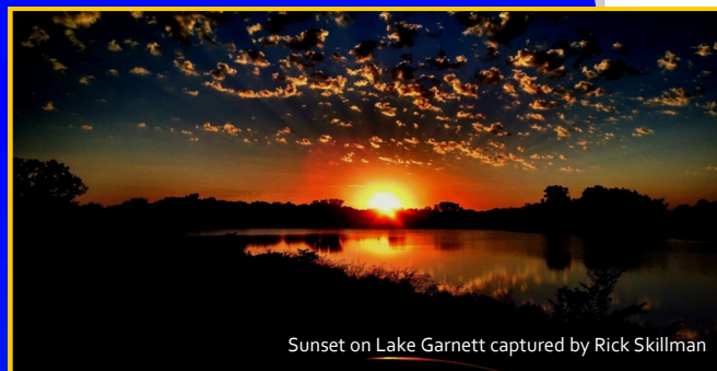
Sunset on Lake Garnett