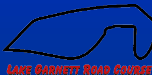
LAKE GARNETT ROAD COURSE