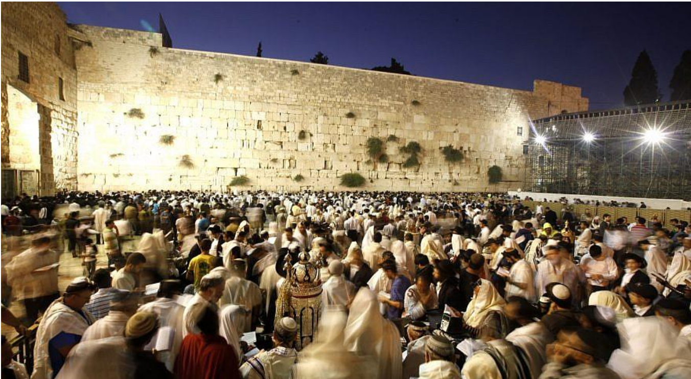
Seeking unity among losses that are incalculable...