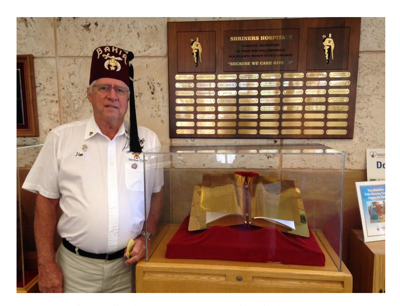
Lobby of The Shriners Healthcare for Children-Florida

The "Gold Book" and the "Because We Care" Gifts Plaque