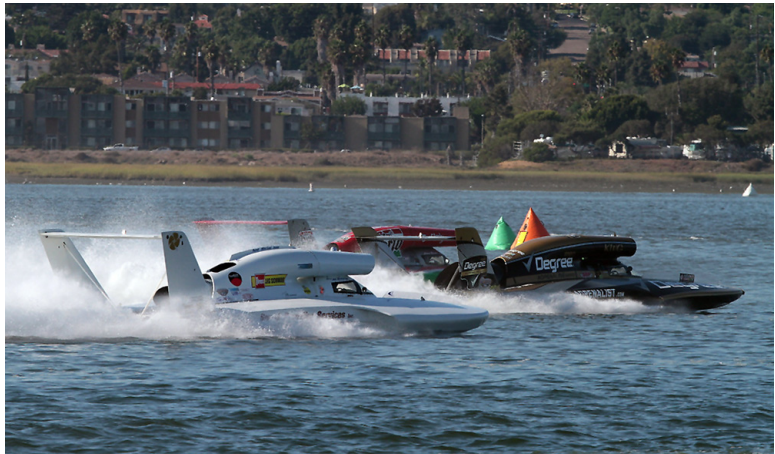
Jones Racing outside of Degree Men , and Oh Boy! Oberto on the inside, setting up for the start of 1B.