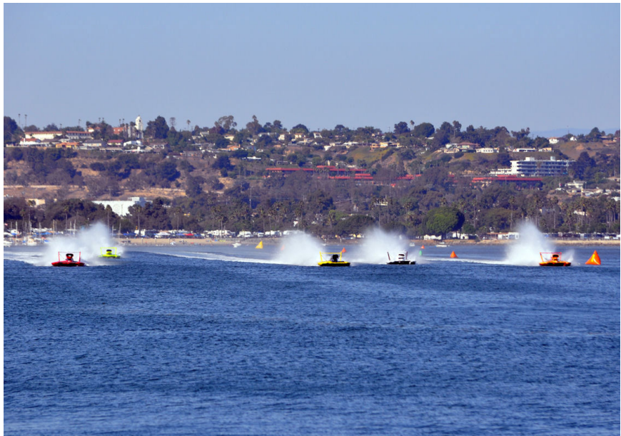
From the outside in are DiJulio , Peters & May , Fox Plumbing , Qatar , and Graham Trucking starting the rerun of 1A minus Red Dot .