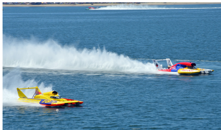
The 18 Bucket List , 17 Red Dot , and In the background, the 6 Oh Boy! Oberto half a lap ahead of them in 2B. Kip Brown was forced to drop out.