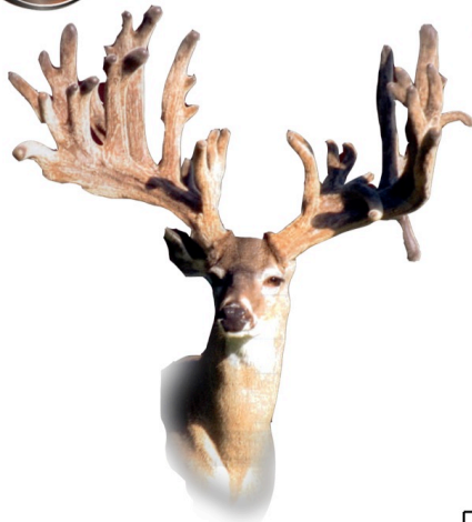
Bambi Yardstick DNA# 10424