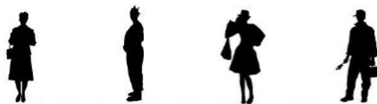
Neighborhood Captains (3-5 in a Precinct)