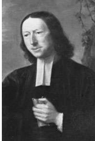
John Wesley (1703-1791) Christ Church, Oxford Alumni