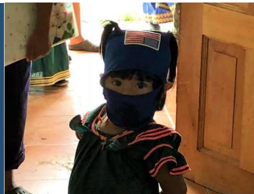
Donated shirt becomes a face mask in Panama.

The Salvatorian Mission Warehouse closed for two months due to COVID-19 in an effort to keep our volunteers safe. We are now open on a parttime basis for essential activities.