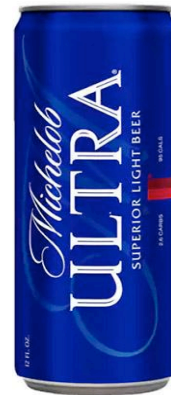
Mich. Ultra 3