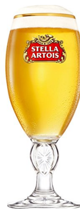
Stella Artois 4