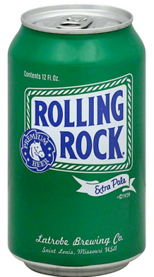
Rolling Rock 3