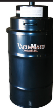
DC1633 33 Gallon Interceptor

(DO NOT MOUNT OVER 8' HIGH IN WARM AREAS.)