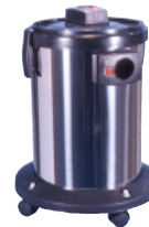
CWP332 Commercial Stainless Steel Wet Pickup Bucket