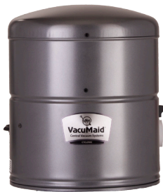
S2700 Power Unit