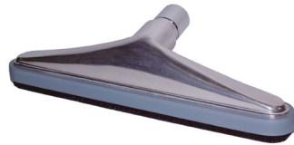
IFB-635 14" Industrial Floor Brush