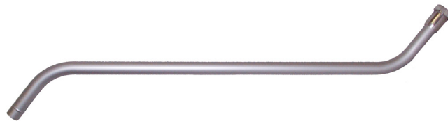
IWA-24 Aluminum Curved Wand