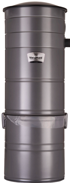
DC-1240 Primary Powder Canister