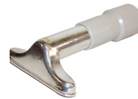
IW-224 & IW-221-2 Handi Tool