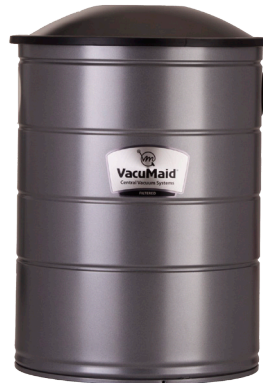
DC-500 Secondary Powder Canister