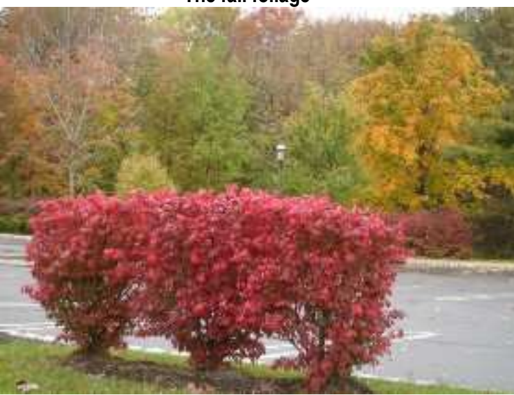
More fall foliage