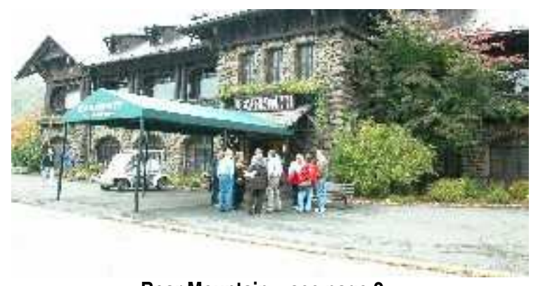
Bear Mountain – see page 2