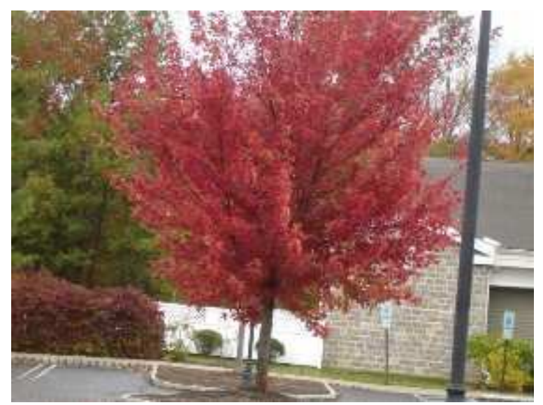
The fall foliage

If any one has info on shows and swap meets in Dec and forward please let me have the particulars for the newsletter.