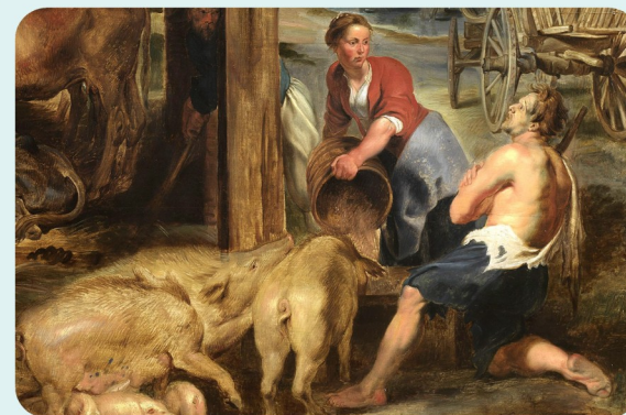
THE PRODIGAL SON, PETER PAUL RUBENS