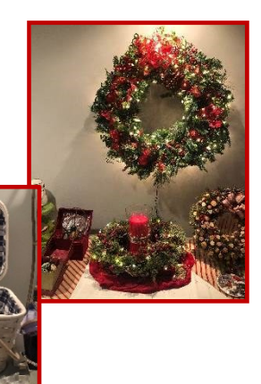
Above: A few of the items that will be in the Silent Auction.

Please remember to bring cash, check or credit card to purchase items from the auction.