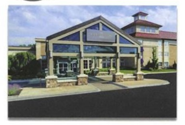
The Kensington Hotel 3500 S. State St. Ann Arbor, MI 48108