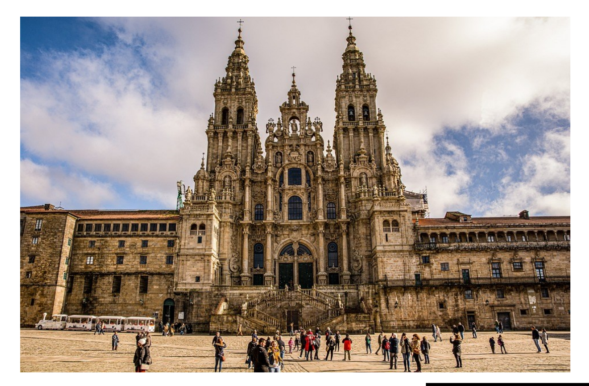
Day 8 / June 4 - Santiago de Compostela, Spain

Today we depart Fatima enroute to Santiago de Compostela in Spain. This famous pilgrimage site in north-west Spain became a symbol in the Spanish Christians' struggle against Islam. Destroyed by the Muslims at the end of the 10th century, it was completely rebuilt in the following century. With its Romanesque, Gothic and Baroque buildings, the Old Town of Santiago is one of the world's most beautiful urban areas. The oldest monuments are grouped around the tomb of St James and the cathedral, which contains the remarkable Pórtico de la Gloria. Upon our arrival, we will check in to our hotel and have some time to relax and freshen up. Supper included, overnight in Santiago .