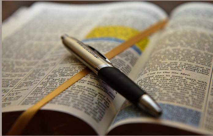
There is nothing wrong with having a Bible study and writing things down, but when you use that pen to change the meaning of the Bible then teach it to people it becomes heresy.

When one decides he is going to have a religion in his life, he is faced with many options. There are many many different religions and bibles, and there over 100 versions of the Christian Bible alone. What do we choose? Do we become Muslim, Hindu, Voodoo, Jewish, Buddhist, Taoist, or any one of the derivatives of Christian such as Jehovah's Witness, Charismatic, Pentecostal, Mormon and many others? Many times we are born into a family that practices a certain religion, but if we are in a free country we can be any religion we choose. Should we look for the church that comes the closest to what Jesus gave us? How would we know?