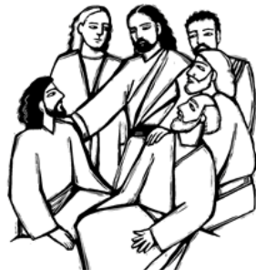
Calling the Twelve to him, he sent them out two by two. Mark 6:7 (NIV)