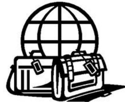
Take nothing for the journey except a staff. Mark 6:8