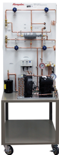
MODEL H-HP-3 Dimensions: 60"H x 30"W x 28"D Shipping Weight: 375 lbs

The Hampden Model H-HP-3 Heat Pump Demonstrator provides students with the ability to observe and operate a full-size combination air conditioning/heat pump unit. It is a combination system that uses the refrigeration cycle to either extract heat from, or deliver heat to, a comfort conditioned area. A readily detachable box encloses the area to be cooled/heated. When the thermostat is set for cooling, the enclosed coils act as an evaporator. A resistance heater provides additional heat load, as desired. For heating, the same coil acts as a condenser, discharging heat into the area. Power required: 120V AC 1Ø 60Hz.