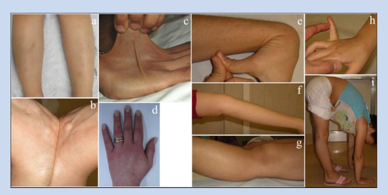
FIG. 1. Main manifestations of Ehlers—Danlos syndrome hypermobility type. Cutaneous findings (a–d): easy bruising (a), pressure-induced papules (b; see also the clinical video clip), skin hyperextensibility (c), and Raynaud phenomenon (d). Joint hypermobility (e–i): hyperextension of the thumb in passive apposition to the flexor aspect of the forearm (e), hyperextension of the elbow (f) and knee (g) beyond 10°, forward flexion of the trunk with the knees extended and the palms resting flat on the floor (h), and hyperextension of the mecarpophalangeal joint of the V finger in passive dorsiflexion beyond 90° (i). [Color figure can be viewed in the online issue, which is available at www.interscience.wiley.com.]