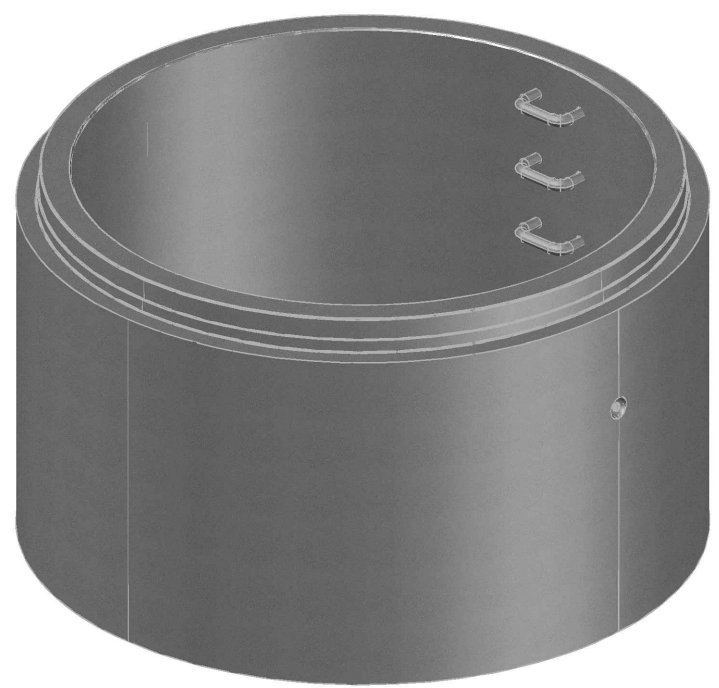
ISOMETRIC VIEW NTS