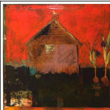
September Hut by Sheep Jones