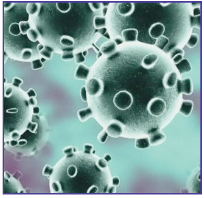
FIGU COVID INFORMATION UPDATES: https://ca.figu.org/coronavirus.html

Articles from the FIGU Zeitzeichen which are sourced from English articles: https://ca.figu.org/external-coronavirus-articles.html