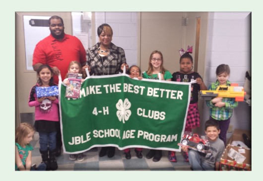
Total 4-H Enrollment on Virginia Military Installations—1,909 Military Youth

Please continue to read the 2015 corporate report and learn about our many program accomplishments.