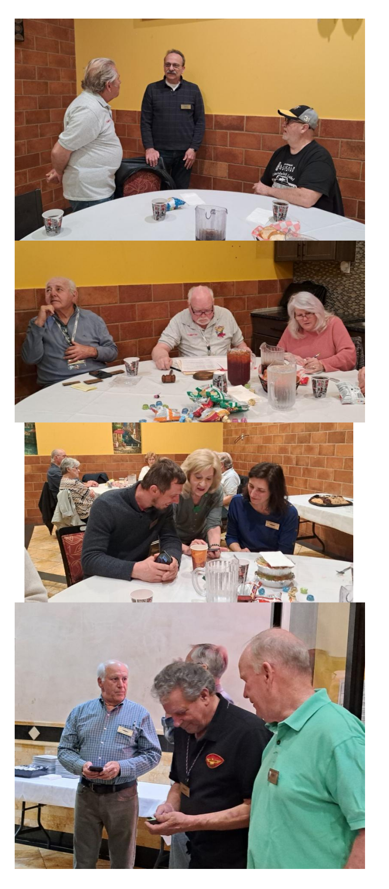
Ever Wonder Why? Noses run while feet smell