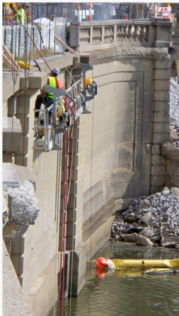
Scioto Mile | Columbus, Ohio

Every Midwest Maintenance associate has received multiple safety certifications.