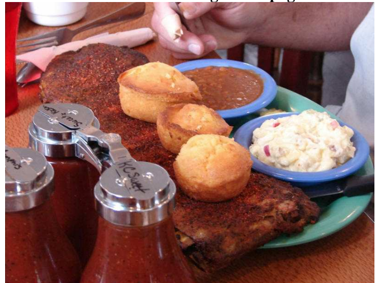
Ribs at Enoch's BBQ

I had a nice pic of Arlene with a big bowl of ice cream. Not enough space to include it. Maybe next month?