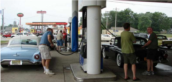
Gas stop-9 Birds at the pumps