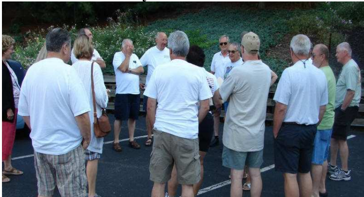
Instructions at starting off point