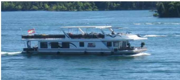
Tour boat going along side the "Belle"