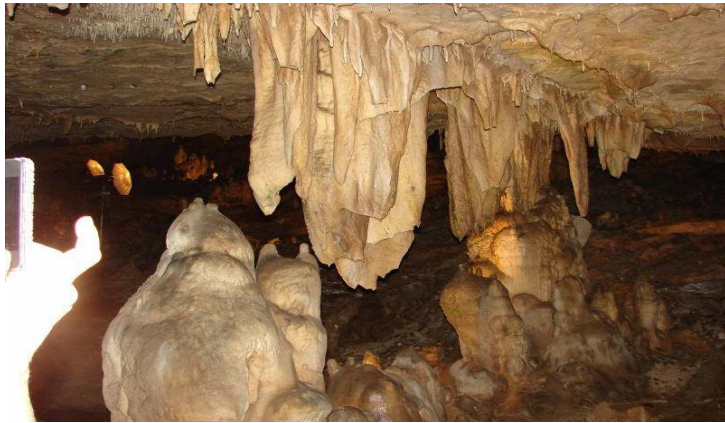
The Cavern Tour