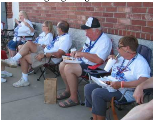
Enjoying chili dogs at Cruisin USA