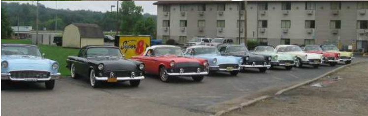
Hotel wanted a pic of the cars with their sign