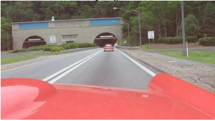
On the road- PA Tunnel

Here are some random pics of the CTCI convention in Springfield