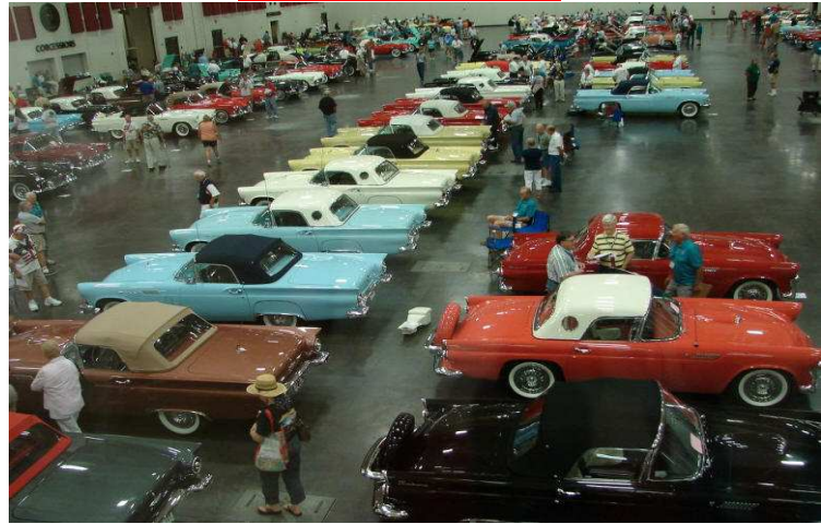
partial floor shot