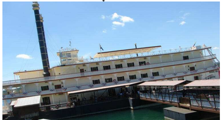
Showboat - The Branson Belle