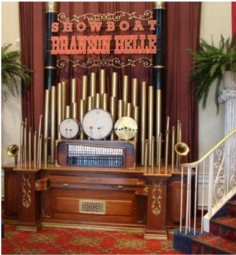
Lobby of the "Belle"