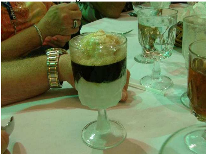
Root Beer Float at Welcome party