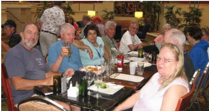
Settling in at the host hotel