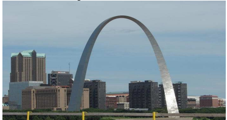
Passed by this - twice