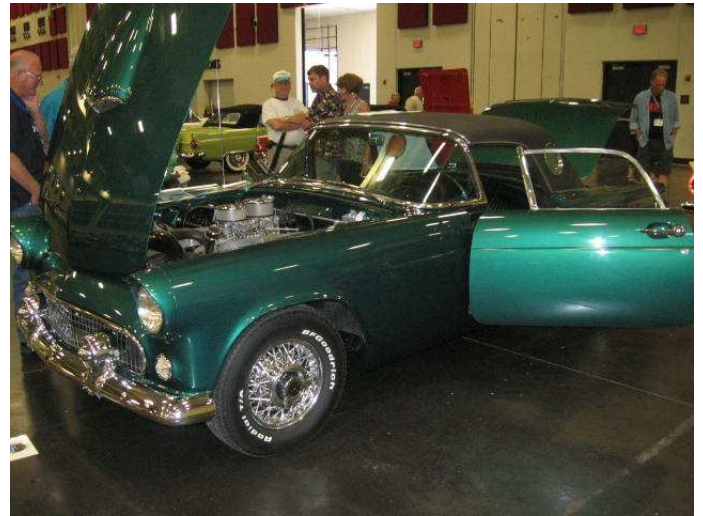
Bird that had trivia engine-see page 10