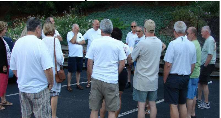
Instructions at starting off point