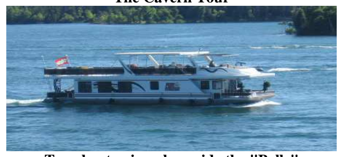
Tour boat going along side the "Belle"