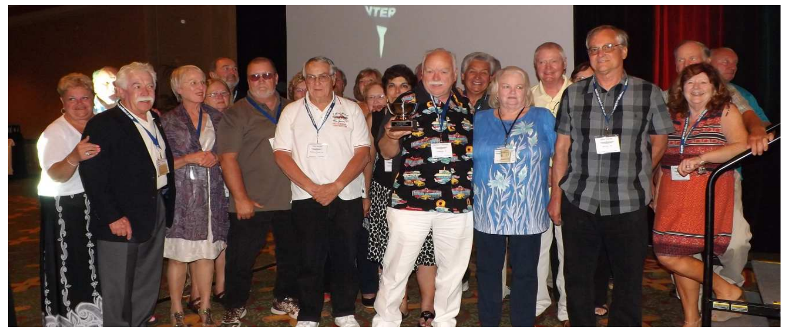
Ford Johnson Award Presentation