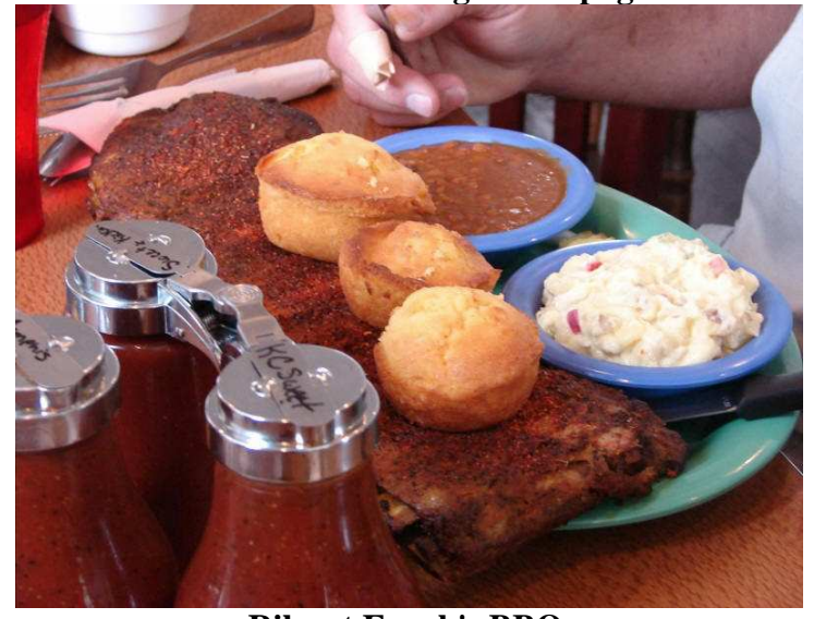
Ribs at Enoch's BBQ I had a nice pic of Arlene with a big bowl of ice cream. Not enough space to include it. Maybe next month?