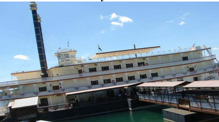
Showboat - The Branson Belle