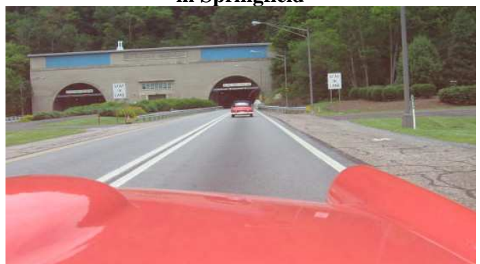
On the road- PA Tunnel

Here are some random pics of the CTCI convention in Springfield