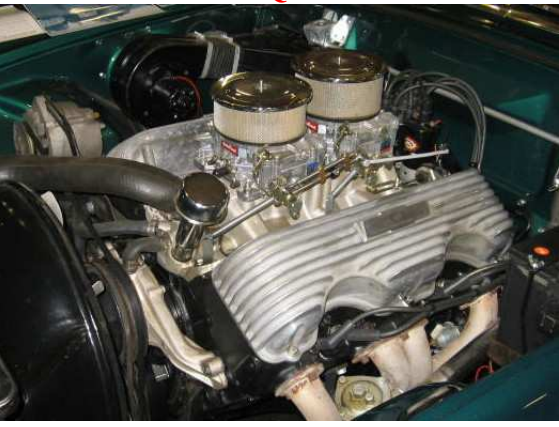
Blasphamy - this was transplanted in one of the Birds (see Page 9) This is a 348/409 brand X engine. These engines had a letter designation - what was it?

The answer to last months trivia was a 1960 Plymouth Valiant. Two respondents only got it partially correct