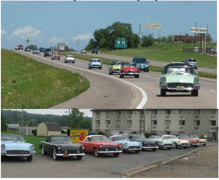
Hotel wanted a pic of the cars with their sign