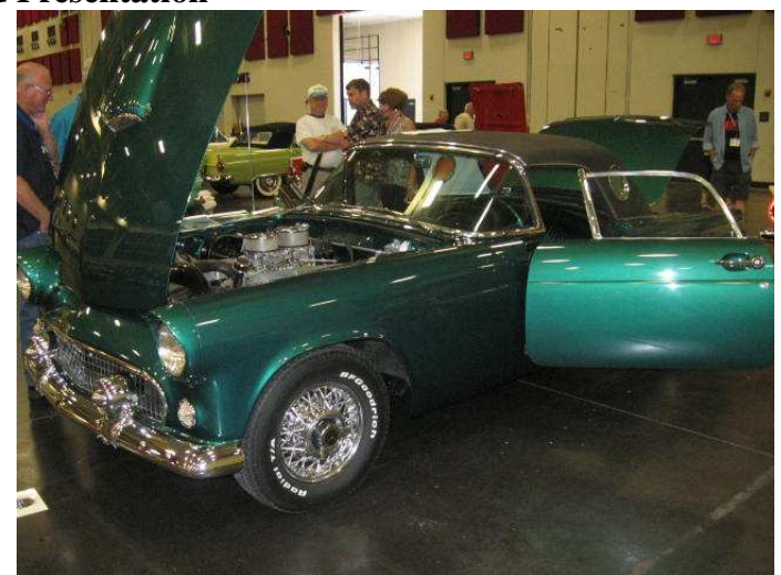
Bird that had trivia engine-see page 10