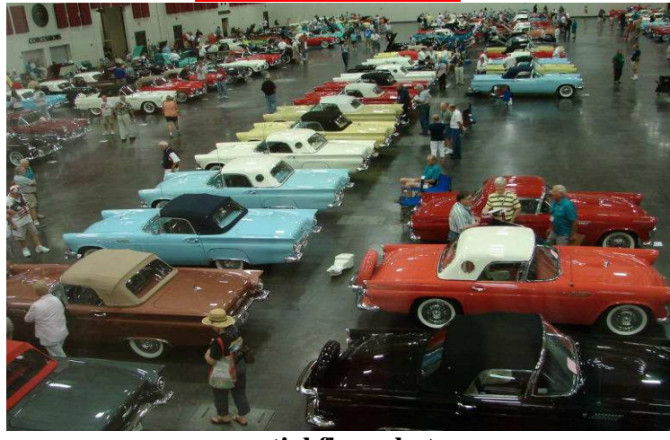
partial floor shot