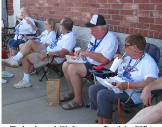
Enjoying chili dogs at Cruisin USA