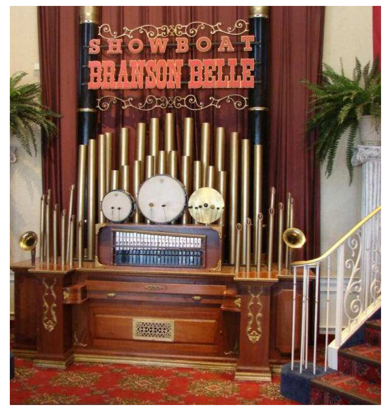
Lobby of the "Belle"