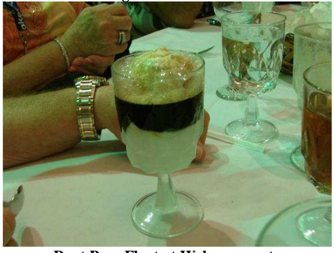
Root Beer Float at Welcome party