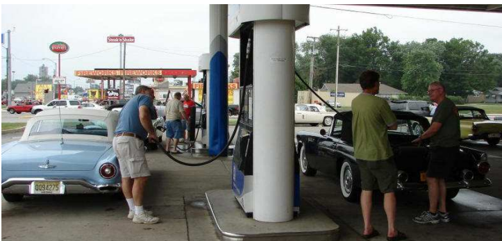
Gas stop-9 Birds at the pumps