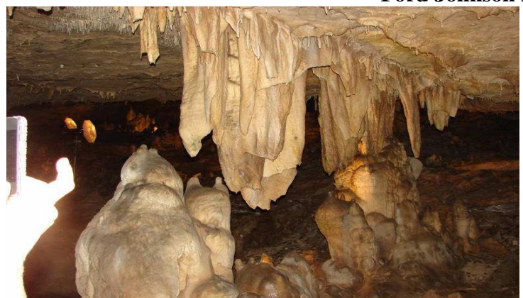
The Cavern Tour