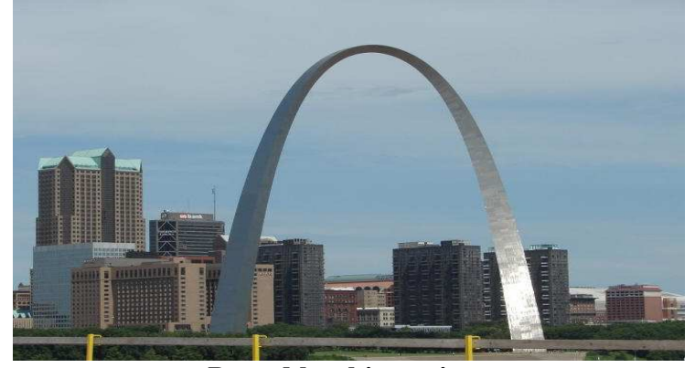
Passed by this - twice