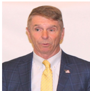
Congressman Rob Wittman spoke about various bills and issues he's been working on in DC and then answered many questions. It is always great to hear from the Congressman, and we appreciate his candor.