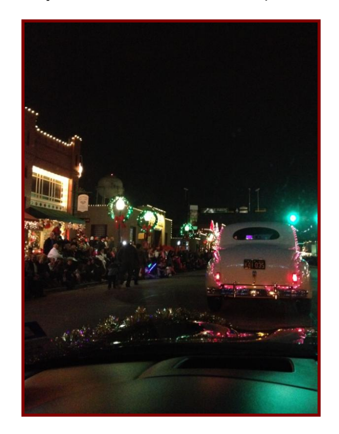
"Light 'em up Grampy!"