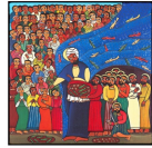
Ninth Sunday after Pentecost: Proper 12 July 25, 2021 | 9:00 am

The Association of the Holy Spirit and Church 1000 Lincoln Street, Suite 1000 Chicago, IL 60606 | 312.626.6799