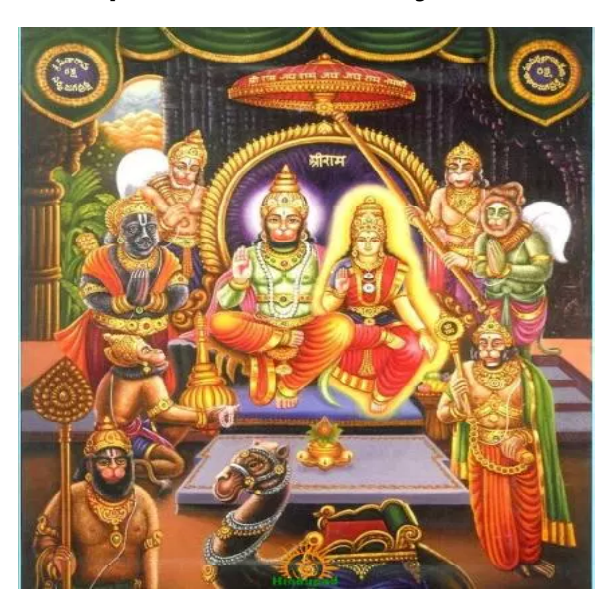
Sri Sai Hanuman Suvarchala Yagnam May 2<sup>nd</sup> Wednesday - May 12<sup>th</sup> Saturday