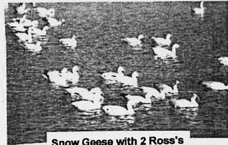
Snow Geese with 2 Ross's Geese in the center

Start off your 2004 bird list with some great entries. Last year 74 species were recorded on our trip, these included 15 waterfowl species, 7 Raptor and 3 grebe, also a number of passerines. The Refuge reported over a dozen Bald Eagles, and we saw 5 at one time.