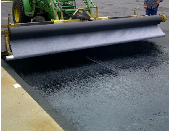
GlasPave Paving Mats feature a thinner yet durable material that requires less tack coat during the installation process than other paving mats. Often times, the amount of required tack coat can be reduced by half!

THE GLASPAVE ADVANTAGE: The fiberglass matrix in a GlasPave paving mat provides significantly greater tensile strength at low strain when compared to conventional paving fabrics and other paving mats. This helps extend pavement life, even in the harshest environments, by delaying reflective cracking, which is a common contributor to costly repairs and the eventual failure of asphalt overlay applications. Also, the non-woven matrix structure of GlasPave allows for an asphalt binder to penetrate and fill voids within the fabric to limit moisture infiltration into the pavement. The distinctive design facilitates a quick and strong bond with a variety of tack coats.