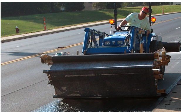
The GlasPave 50 wide-width rolls allow faster installation that can result in a savings on labor costs.

THE CHALLENGE: Due to reflective cracking, concrete streets with asphalt overlays tend to have a short service life, 10 years or less, and expensive pavement maintenance afterwards. The challenge was to increase the life cycle of resurfaced streets and decrease the maintenance costs by reducing the number of joint repairs, reinforcing the resurfaced asphalt and waterproofing the pavement. The City of Westlake's 20-foot wide concrete streets featured centerline and transverse joints every 25 feet that were randomly failing.