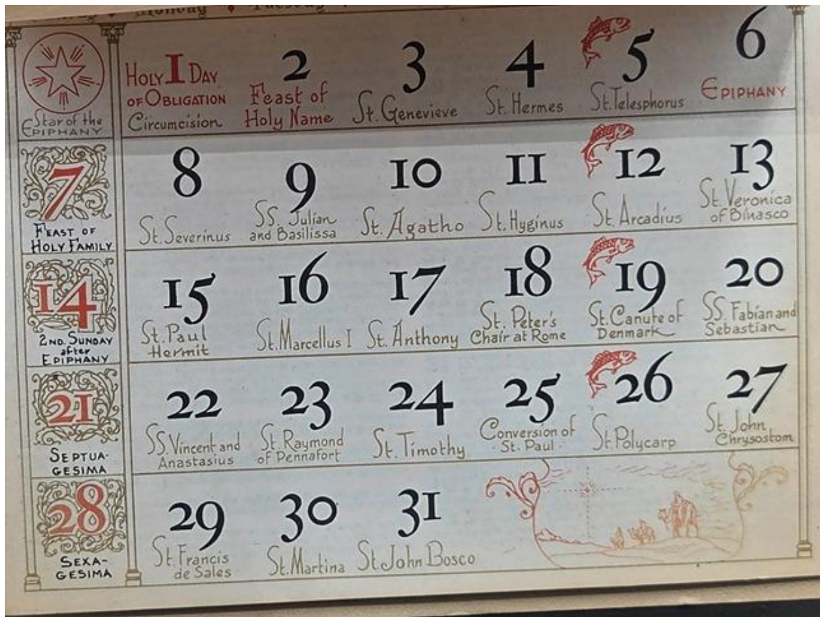
Page from the St. Paul's calendar.