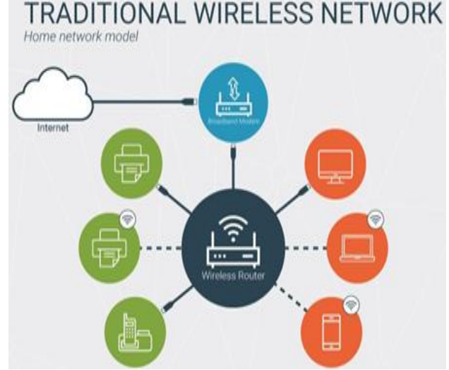
Figure 2(a): Traditional Wireless Network Diagram [2].

shown in Fig.2a and Fig.2b respectively.