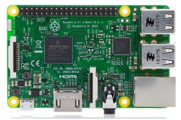
Figure 3: Raspberry Pi Microcontroller

A Raspberry Pi is a thirty five dollar, credit card sized computer board which when plugged into an LCD and attachment of a keyboard and a mouse, it is able to complete the functions of any regular PC can. Like a PC, it has RAM, Hard Drive (SD Card), Audio and Video ports, USB port, HDMI port, and Ethernet port. With the Pi, users can create spread sheets, word-processing, browse the internet, play high definition video and much more. It was designed to be a cost friendly computer for users who needed one. There are two models, Model A and B. Model B is the faster containing 1GB of RAM as well as the ability to over clock.