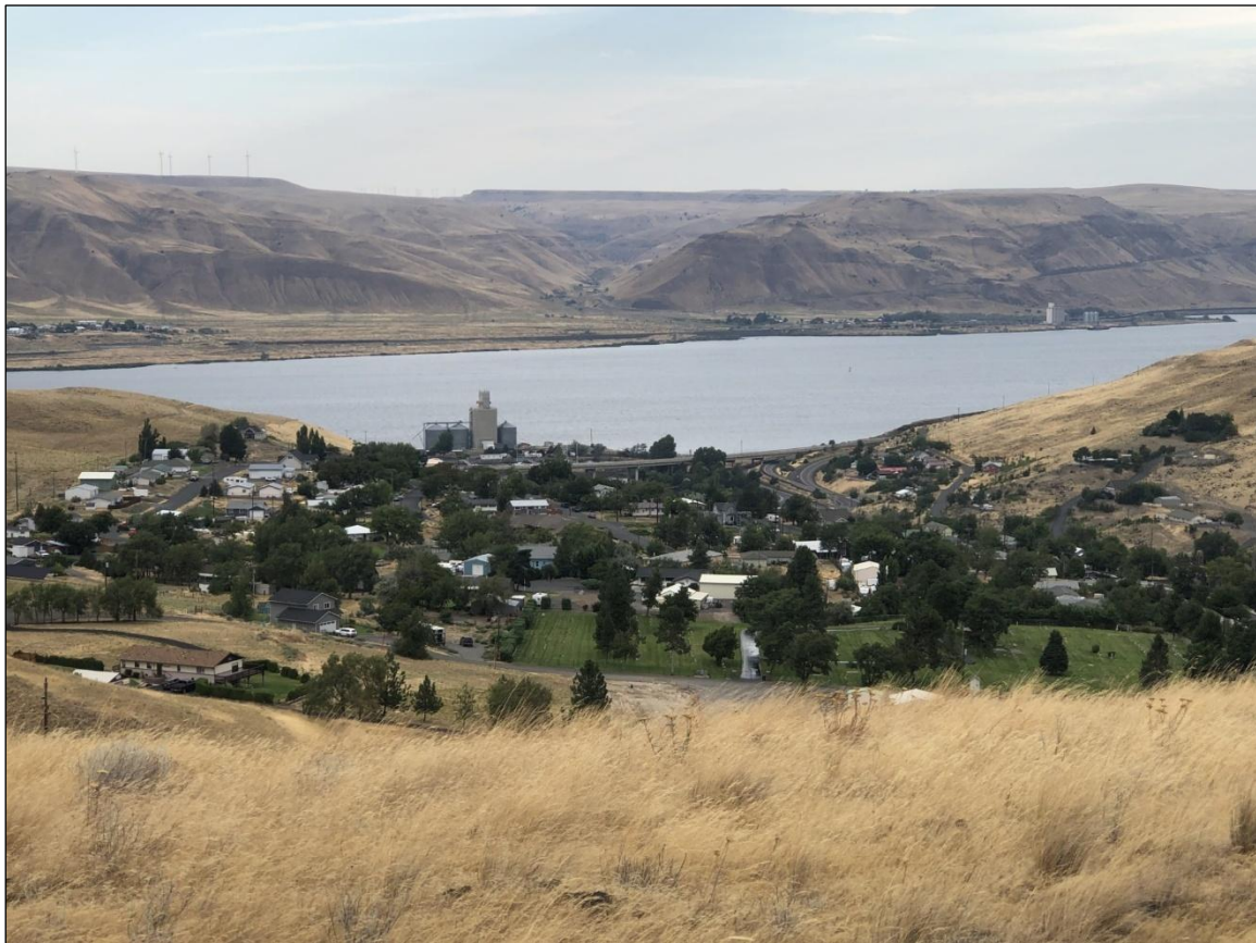
Alkali Ridge Viewpoint

RFP – Port of Arlington – Realty Marketing Services – Alkali Ridge Subdivision