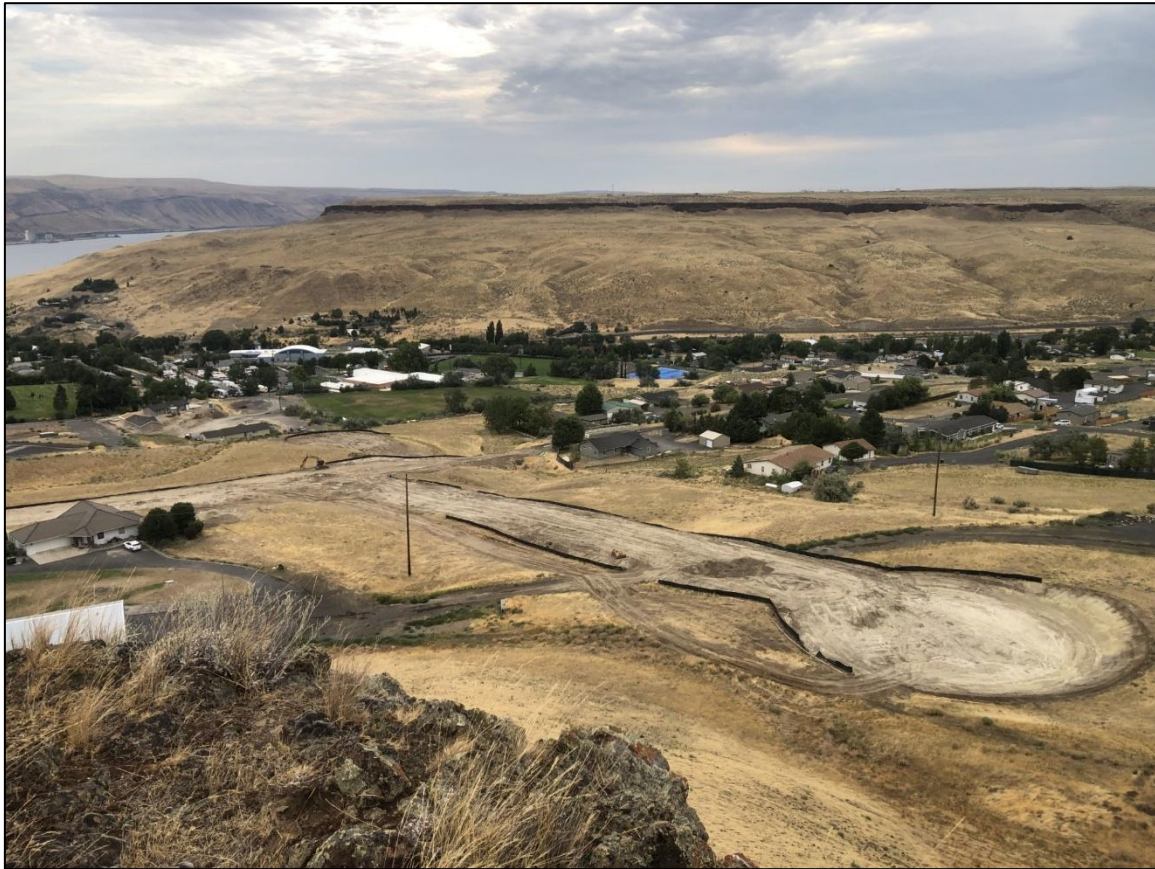
Alkali Ridge Construction – Grading Overview