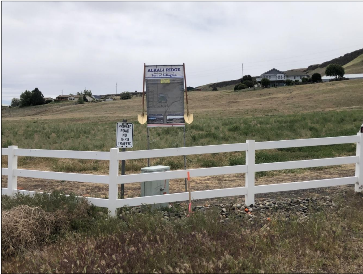
Alkali Ridge Entryway Groundbreaking