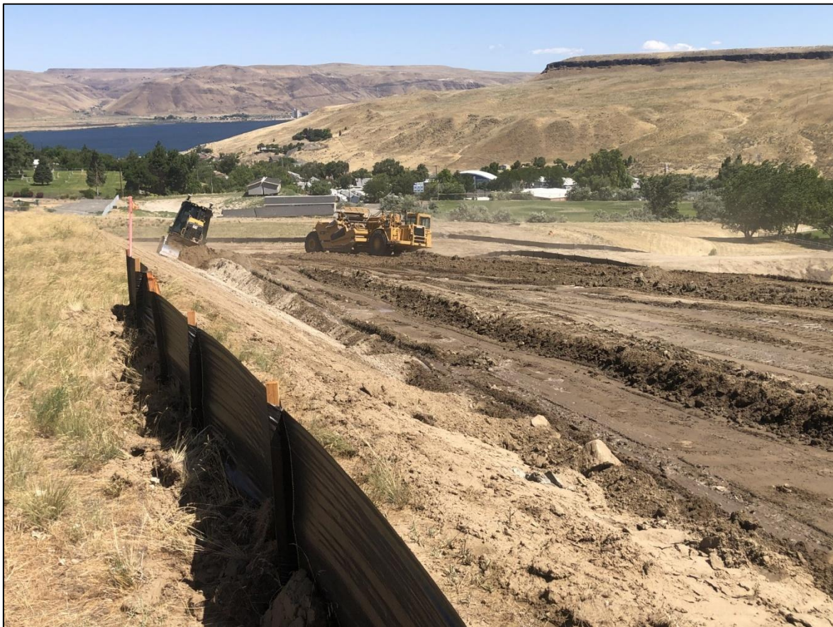
Alkali Ridge Construction – Grading Detail

RFP – Port of Arlington – Realty Marketing Services – Alkali Ridge Subdivision