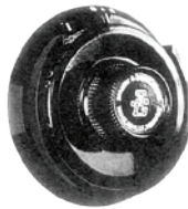
D022/D023 WITH R162