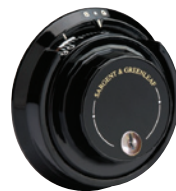
D225 WITH R167