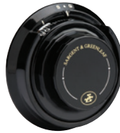
D220 WITH R167