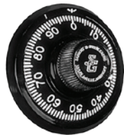
D003 WITH R004