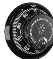
D690 WITH R211