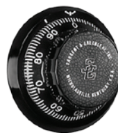
D300 WITH R211