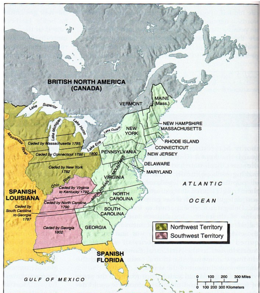
Federal/Public Domain Land Created from State Cessions under the Thirteen Articles

One other development – The Land Ordinance of 1785 -- will also help the Federal Government finance itself over the long-run.