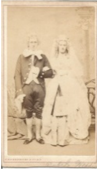
“We the People”

In March 1781, the Second Continental Congress gives way to what becomes known as the “Congress of the Confederation” or “The United States in Congress Assembled,” operating under the Thirteen Articles framed in 1777.