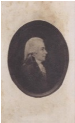
Alexander Hamilton (1755-1804)

The perils of this bankruptcy are best known to the soldiers fighting the war, especially George Washington and his principal aide-de-camp, Alexander Hamilton. Both men are Federalists, and together they push Congress to name a “Superintendent of Finance” to restore the American economy.