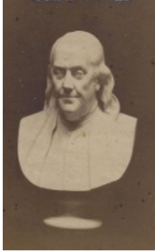
Benjamin Franklin (1706-1790)

During the colonial period, America's economy has utilized three forms of "money:"