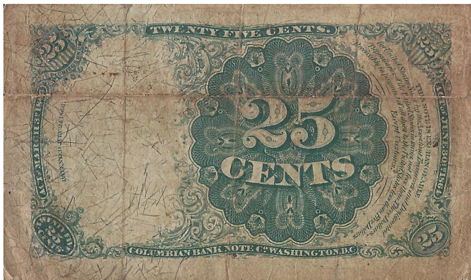
Printed Money, often not "Backed" by Gold/Silver, Suffers from Inflation

Fighting the Revolutionary War has proven immensely costly to both sides.