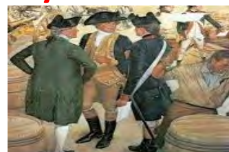
1 Year's Paid SAR Membership

Tickets available through WSSAR Chapter Presidents and State Society Officers. Drawing 04/09/2022