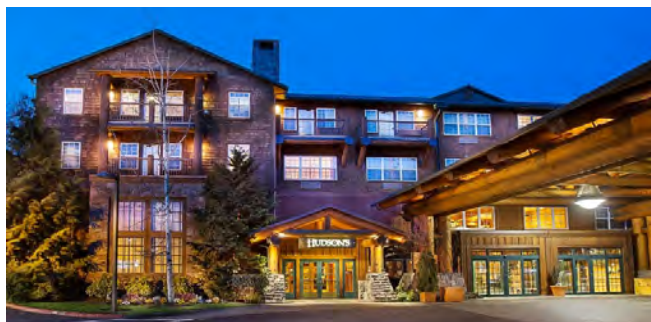
The Heathman Lodge—Vancouver, WA