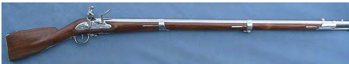
1766 Charleville Marine & Navy Replica Musket