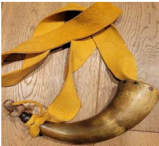
Antique Powder Horn