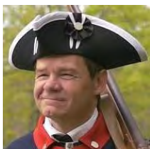
A Tricorn Hat