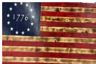
1776 Flag Art