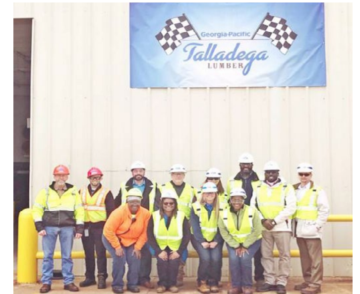
CSX Cross-Departmental team