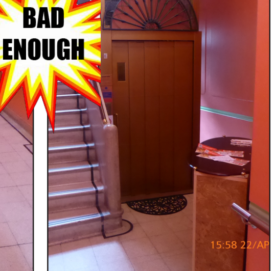
NOW...AS PREFERRED BY CERTAIN LESSEES