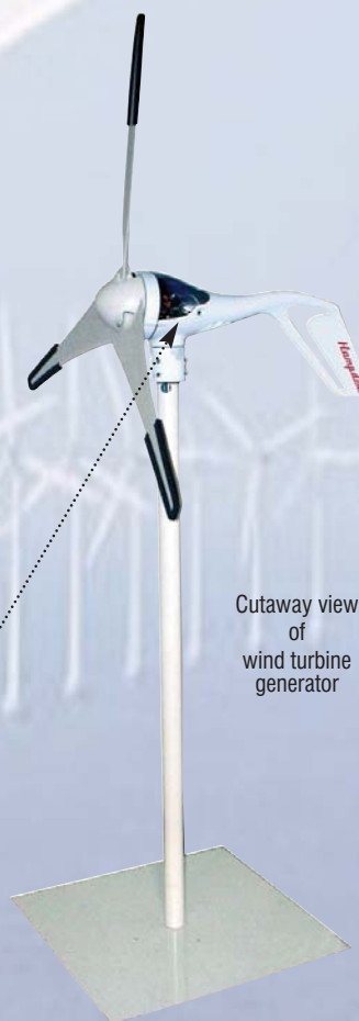
Cutaway view of wind turbine generator