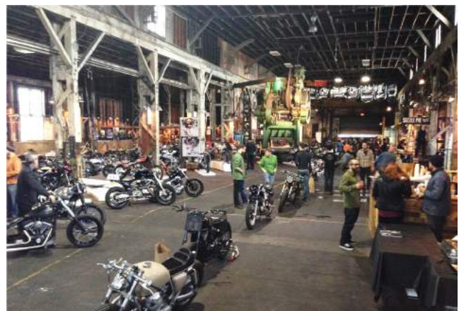
The One Moto Show as bikes are lined up for photographs. The show is held in an old foundry.