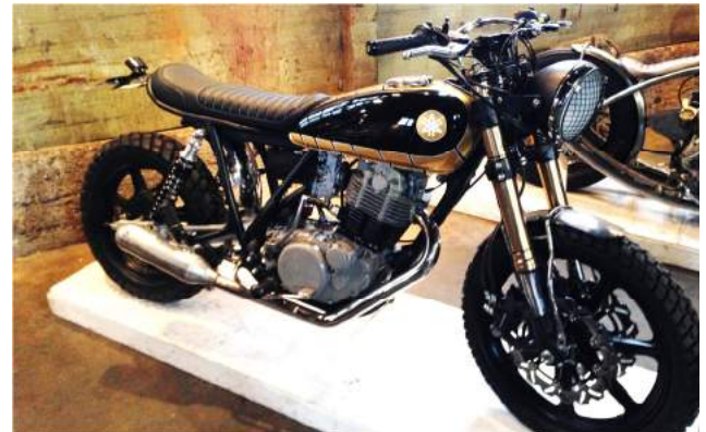
1978 Yamaha SR500, owned by Tory Pototoka, built by Dirt First Garage, Vancouver, BC