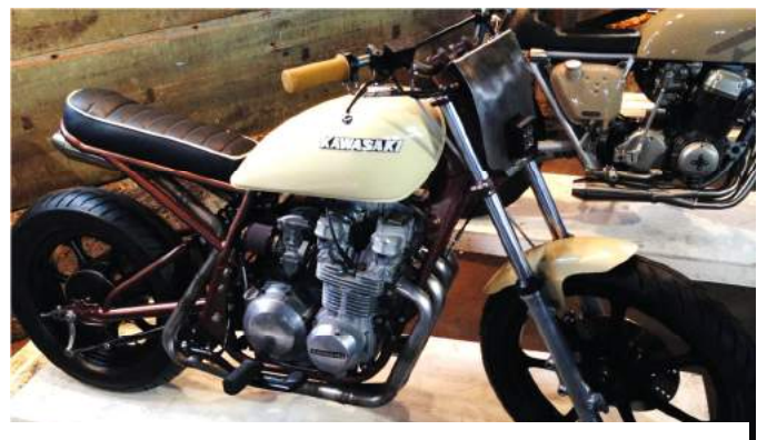
1981 Kawasaki KZ550, owned by Grant Gard, built by No.8 Wire, Missoula, MT