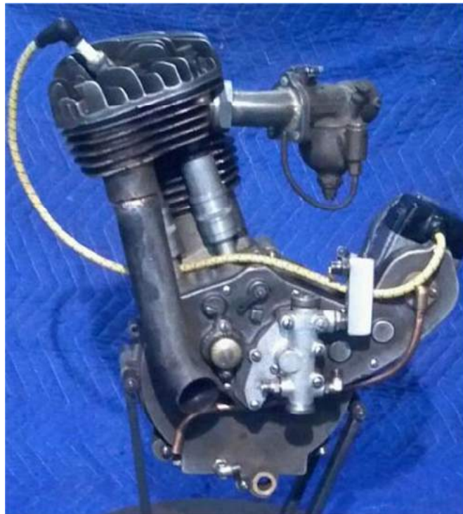
1915 Indian Race Motor by Ken Edminston This engine started life as a Power Plus Single Engine, then modified with a later model cam chest, to facilitate a return oil pump and a later Chief cylinder. Upon inspection, this engine was found to have all modern bearings, a polished connecting rod, and what appears to be a custom made cam and a high-compression head. http://classicmoto-cycles.blogspot.com/2012/05/1915-indian-race-motor-by-ken-edminston.html