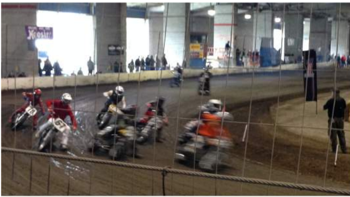
Flat track race at Salem Fairgrounds