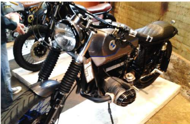
1976 BMW R nine T/6 built by Analog Motorcycles