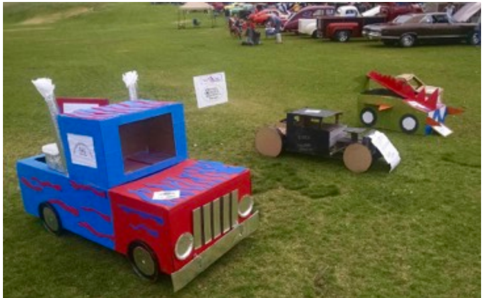
PCK won first choice in the "Build Your Dream Vehicle" contest at the "Beeline Cruise-In Car Show" sponsored by Payson Concrete and the Rim Country Classic Auto Club in April at Green Valley Park.