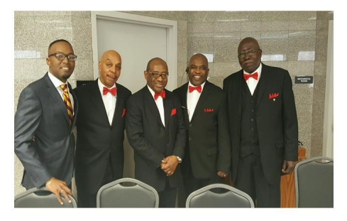
Fill The Bus August 05 , 2017