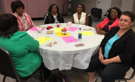
Cultural Bazaar & Back to School Community Day August 26, 2017