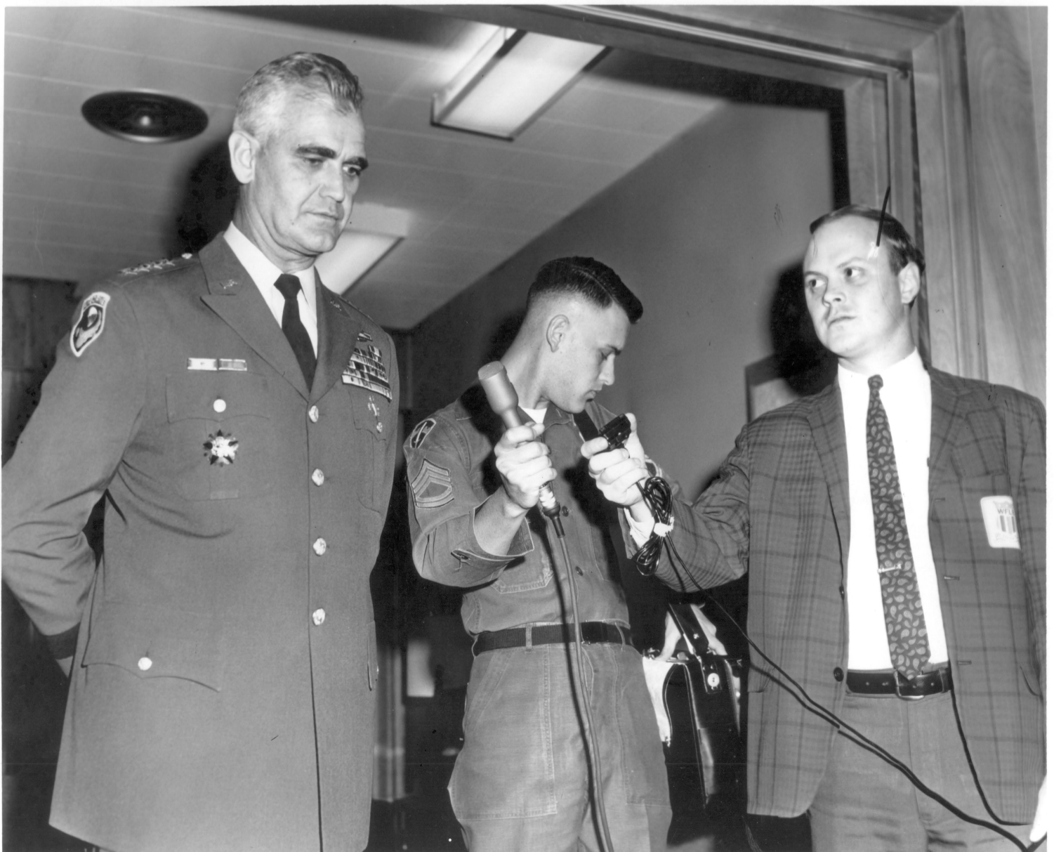
GENERAL WESTMORELAND - APRIL 28, 1967