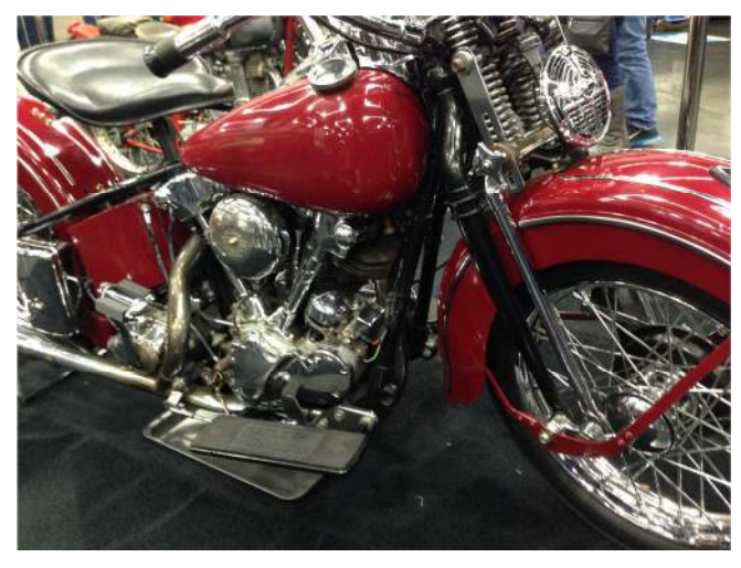
Nils Olson's 1939 Harley-Davidson EL 1000 cc