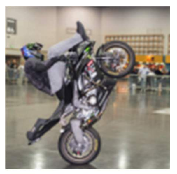
Stunt Rider at International Motorcycle Show