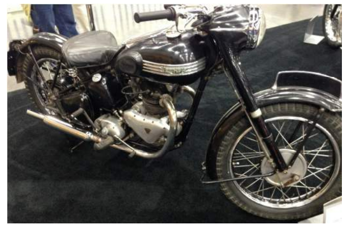
Nils Olson's 1953 Triumph 37 DeLuxe 350 cc