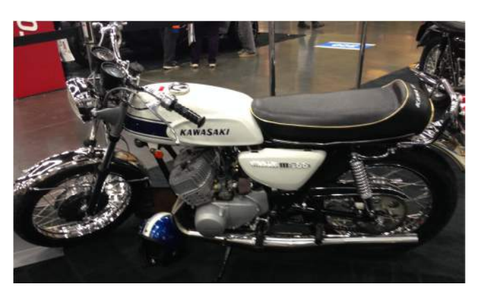
Frank Grimer's 1969 Kawasaki Mach III 500 cc