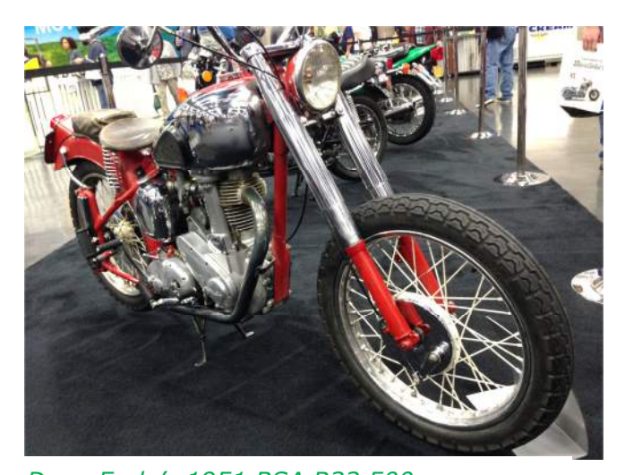
Doug Earle's 1951 BSA B33 500 cc