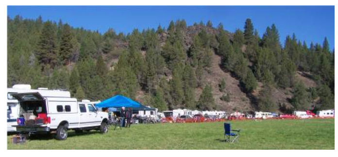
Camping at Canby Races

Saturday was the vintage observed trials, with 45 riders in 10 classes, divided into Novice, Intermediate, and Expert. Observed trials are a very significant part of historic motorcycle competition. It began as a wintertime sport for European enthusiasts, who tested themselves by tracing ancient Roman roads. These riders negotiated various obstacles along the way, all of which gave test to both man and machine. As the "gentleman's sport" developed, such obstacles became more specific, and more challenging. From the 1980s until today, the obstacles presented to trials competitors have been inconceivable for most motorcycle riders.