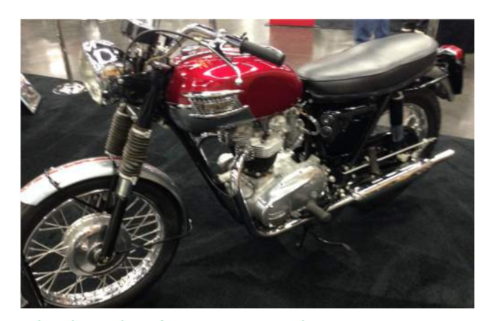
Chuck Hodson's 1964 Triumph TR6 650 cc