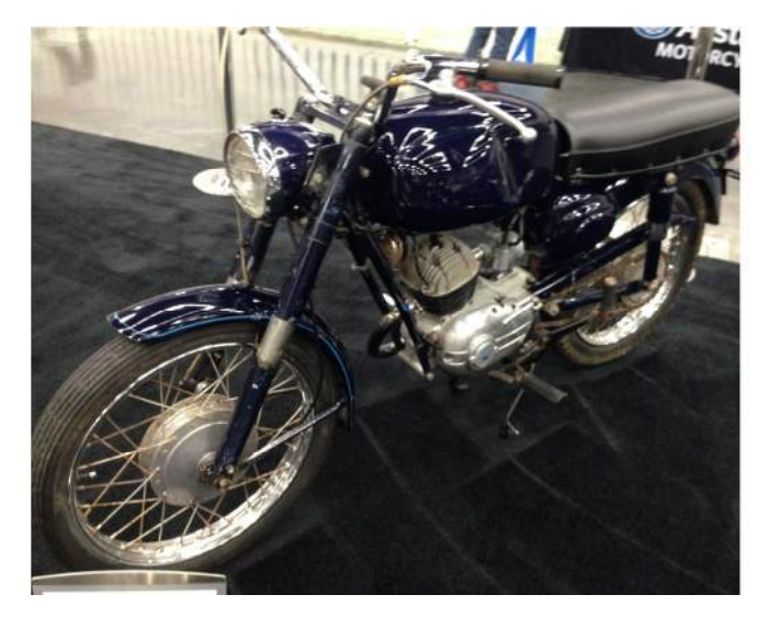
Jeff Earle's 1967 Wards Riverside 125 cc