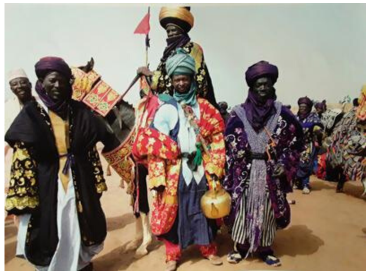
KABI Traditional Dubar