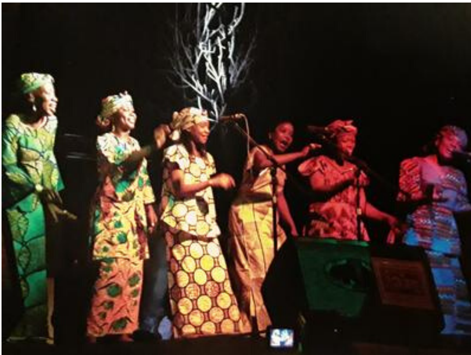
Night Event at the Open Air Theatre

Presentation by selected Artist: drama, dance, songs, folklore, & comedy