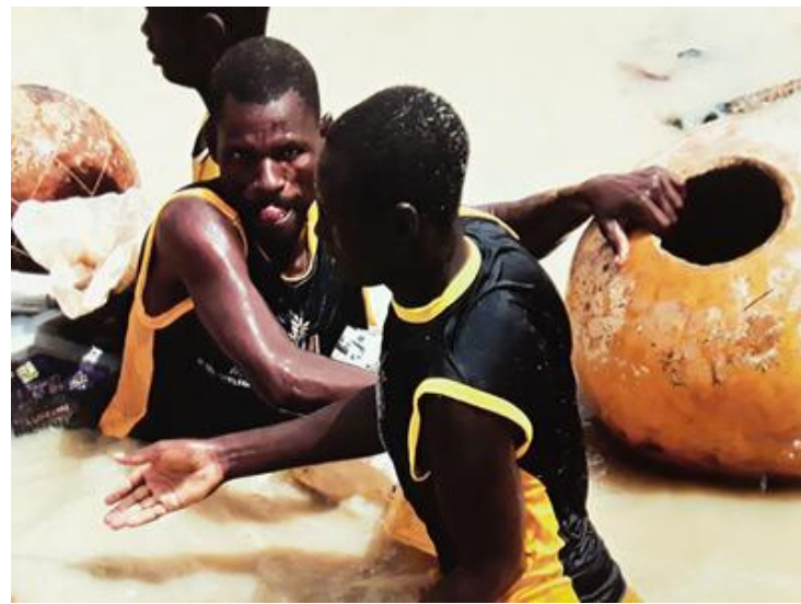
Men Bare Hand Fishing